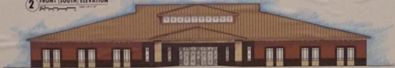
2 FRONT (SOUTH) ELEVATION